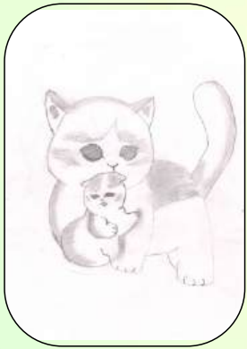
Aardhya - 5D