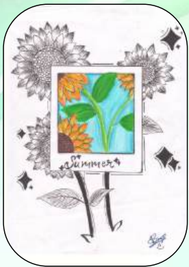
Varnika Singh - 8B