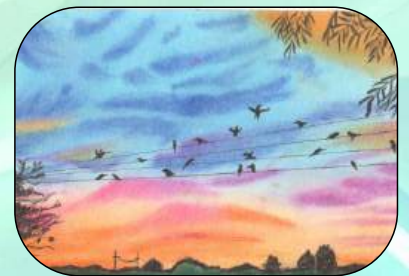
Ayushi Jain 8B