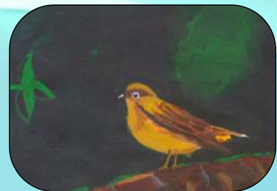
Luv Sarawage - 10B