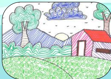
Pruthv Gowda - 5D