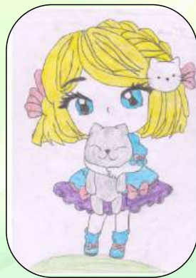
Navya - 6A