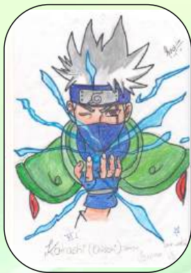
Kakashi - 6C