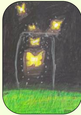
Aninditha - 5D