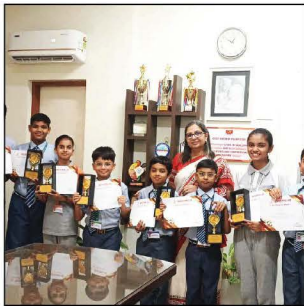
BK Birla Public School, Kalyan