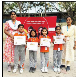
Meridian School, Madhapur, Hyderabad