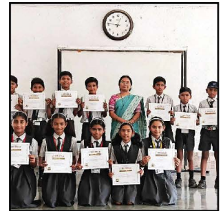
Giants English Medium School, Yavatmal