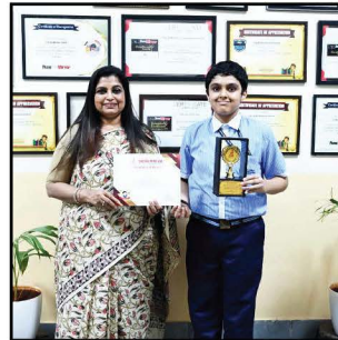
Elpro International School, Chinchwad