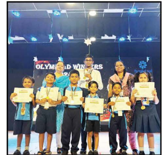
Euro School, Dombivli