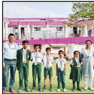
PG Public School, Nandurbar