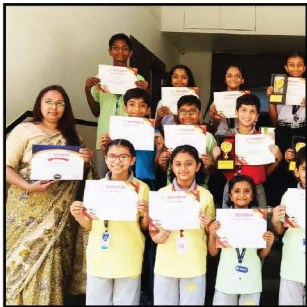
Pawar Public School, Kandivali (W), Mumbai