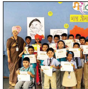
Podar International School (ISC), Pimpri, Pune