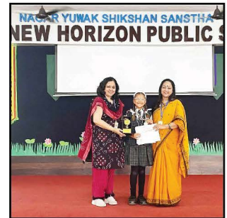
New Horizon Public School, Panvel