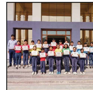
Dr. Balasaheb Vikhe Patil International School, Rahata