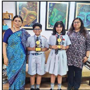
Venkateshwar International School, Sector-10, Dwarka, New Delhi