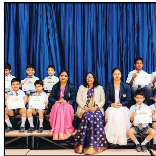
Hutchings School, Talegaon