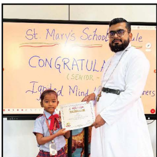
St. Mary's School, Dhule