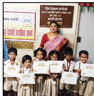
DD alias Babasaheb Deshpande Primary School, Sion (W), Mumbai