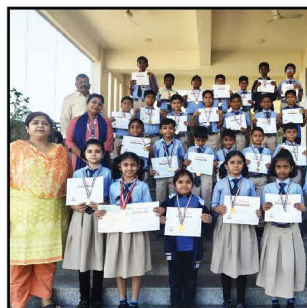
Takshila School, Malegaon, Nashik