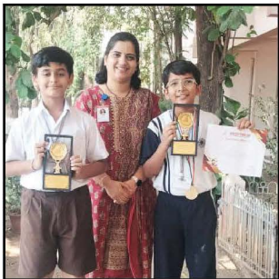
Smt. Sulochanadevi Singhania School, Thane